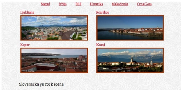
Figure 1. Example of a region page – Slovenia

First the basic composition was made with hierarchy architecture in its core. Instead of making HTML pages for each and every region, city or band, four PHP-scripts that consult the SQL-database were made and depending on the user's choice dynamically generate proper HTML content.