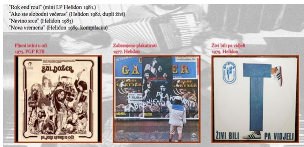
Figure 3. Example of a performer's page – Buldožer

The last script, bend.php has only one link – to go backwards. Role of this script is to generate the performer's biography and discography. For every album figure of the cover is generated, along with the name of the album, year of debut and its publisher company. After the page is loaded, a tune is automatically reproduced, with a large photo in the background.