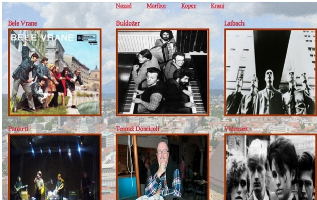
Figure 2. Example of a city page – Ljubljana

By activating the figure hyperlink, user is redirected to grad.php script which generates the list of performers from the specified city along with their respective figures. On the top of the page there is navigation (links to other cities of the same region) (Figure 2). In the background the figure of the city is generated. Every performer's figure is a hyperlink to bend.php script along with the proper parameter forwarding (Figure 3).