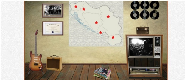
Figure 4. Home page display

As there are many possible outcomes of the pages content, it is necessary to find them an appropriate theme (color) to share. Main color was chosen to be a shade of red (\#dd2233), with strawberry themed heading along with the serif font prociono . Heading which all pages share consists of a main menu, audio player and search bar. They are let floating using the CSS, thus sacrificing the flexibility for looks, on the assumption that the site would be viewed from a standard resolution display.