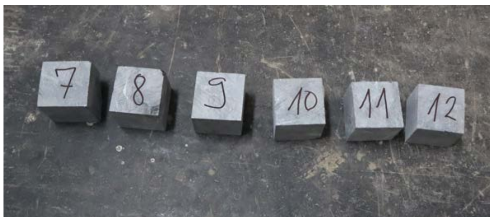
Figure 3. Samples prepared according to SRPS EN 1926 for standard fire test

In Figure 3 samples prepared for standard fire test according to SRPS EN 1926 are presented.