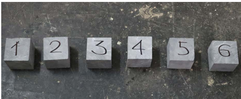
Figure 2. Samples prepared according to SRPS EN 1926 for compressive strength test

In Figure 2 samples prepared for uniaxial compressive strength test according to SRPS EN 1926 are presented.