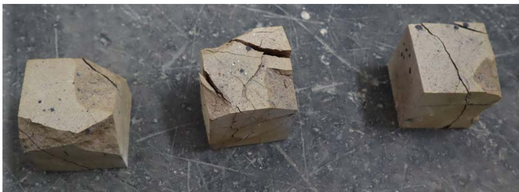
Figure 5. Samples prepared according to SRPS EN 1926 after standard fire test

In Figure 5 samples after standard fire test are shown.