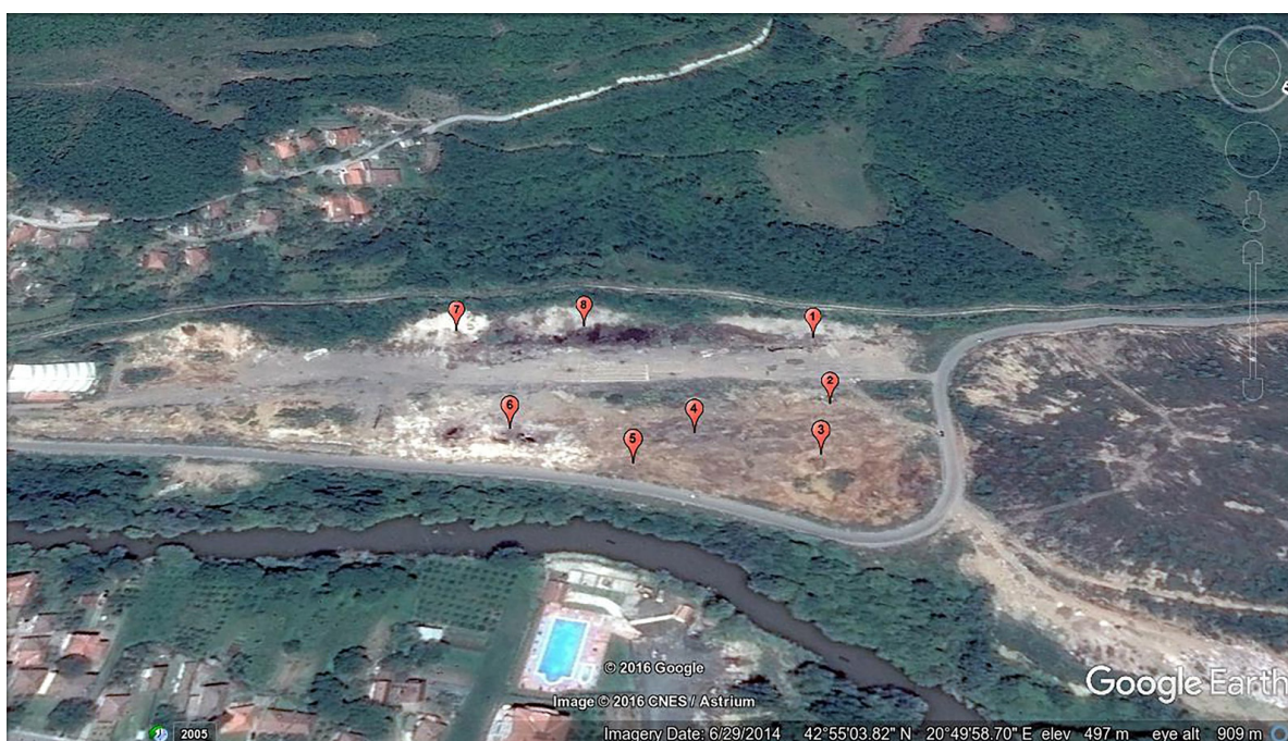
Figure 2. Picture of the tailings with the sampling locations marked.

samples could be considered as representative. The eight analyzed soil samples were taken from the surface at a depth of 50 cm, using a shorter probe of 1 m long of a type referred to as “meia-cana”. The collected soil samples were air-dried indoors at room temperature for a week. After drying to constant weight, the soil samples were homogenized and then ground to a grain size <2 mm to determine soil properties and heavy metal concentrations. The prepared soil samples (1 g from each sample) were subjected to BCR sequential extraction procedures and pseudo-total concentrations of the heavy metals in the study area were determined.