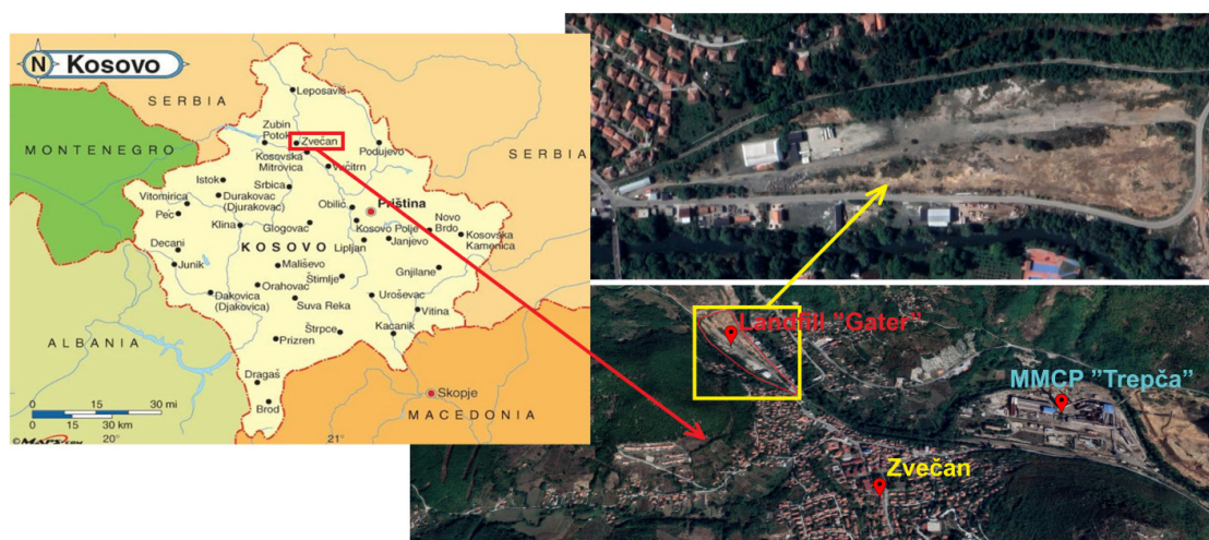
Figure 1. Location of the Gater Landfill in relation to settlements and industrial facilities.

The Gater Landfill is located in the alluvium along the Ibar River, north of the central part of Zvečan (Figure 1). It is irregular and very elongated in shape, measuring about 480 m long at the longest part, and ranging from 80 m wide at the narrowest part to approximately 160 m at the widest part. It is bounded on the south by the Zvečan–Raška Road, on the west by the embankment and the Zvečan–Zubin Potok Road, on the north by the road and the tailings field of Flotation Tailings (which has been partially rehabilitated and recultivated as a part of the process in RMHK “Trepča”), and on the east by the Kosovo Polje–Beograd railway. The altitude (absolute) is between 490 and 500 m, and in relation to the surrounding terrain, it is almost flat, with certain deviations, which range from 0.5 to 2.5 m. In addition, the part towards the West is a hill that is barely elevated, while in the extreme part on the north side, there is a large excavation, about 2–2.5 m deep, which was created during the last cleaning of the landfill.