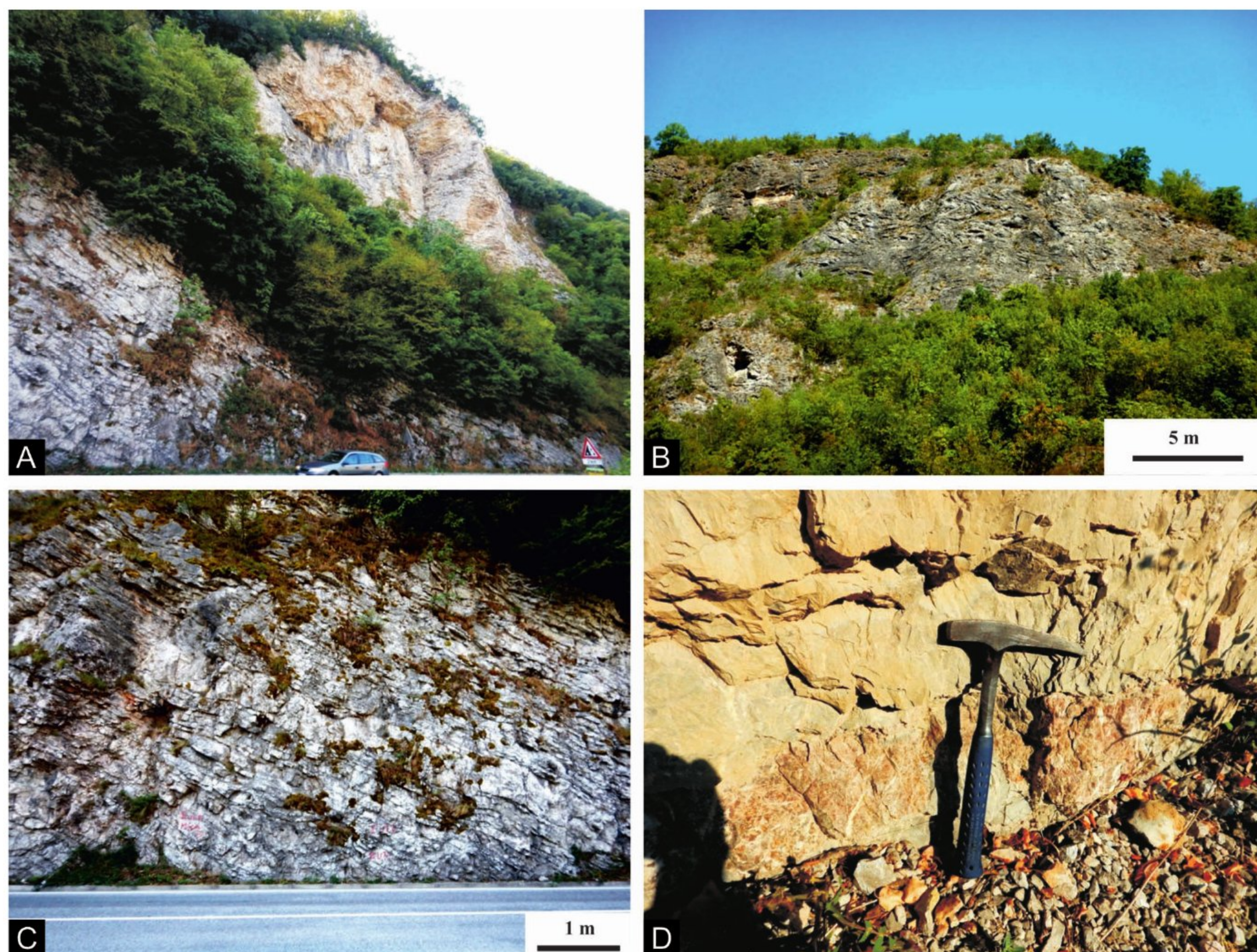
Fig. 2. Limestones of the Grivska Formation in the valley of Lim River near the mouth of Bistricea River ( A , outcrops of the Triassic limestones on the left side of Lim River valley; B , outcrops of the Triassic limestones on the right side of Lim River valley; note intensive folding; C , thin-bedded limestones with single bed of thick-bedded massive limestone; D , chert nodules in limestones; large pink nodule in the lower part of photo; small dark-grey nodule above the hammer).

Samples of cherts and cherty limestones were processed in diluted (10%) hydrofluoric acid (HF) following the method by PESSAGNO & NEWPORT, 1972 and DUMITRICA, 1970, residues were washed by water, then cleaned by hot water (10–15 g) with 0.5 g tetrasodium pyrophosphate ( \text{Na}_4\text{P}_2\text{O}_7 ) to remove clay particles. Radiolarians were picked from dried residues under light binocular microscope LOMO-MBS-10,