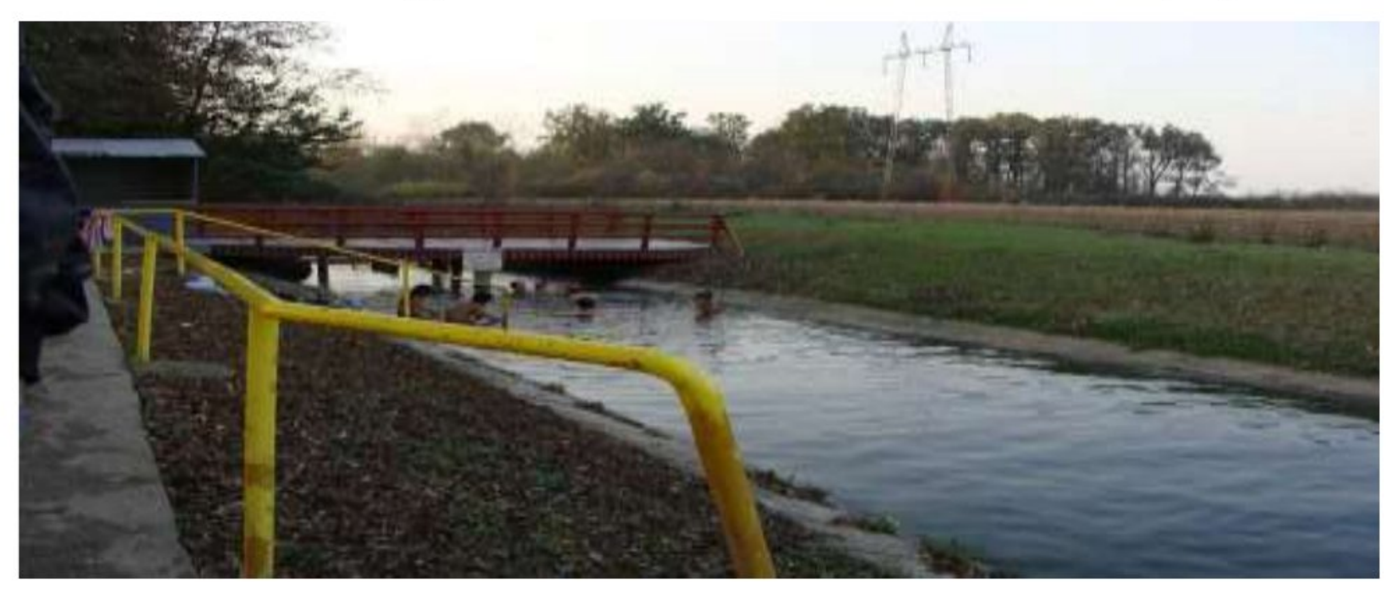
Figure 3: "Spa Jokin Grab" -p regrad in the course of thermal water and the formed pool for swimming

the well, which were filled with sediment. It is expected that after the second rinsing, the BT1 well could give over 40 1 of water per second with a temperature of 75°C to 80°C, which would also cover the waters of the aforementioned hypsometric inflows of water in the well. [19]